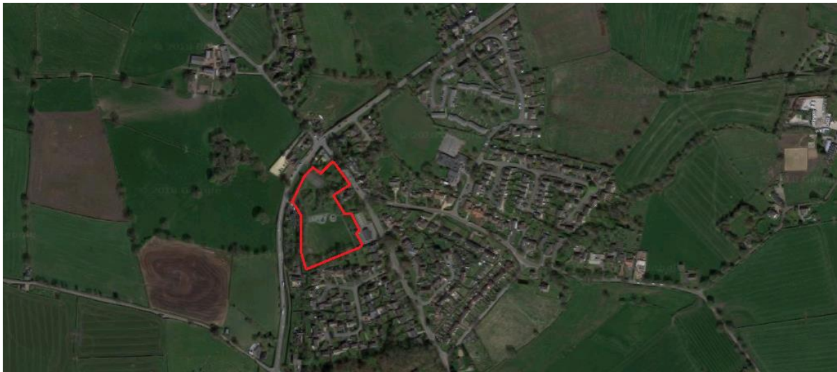
Figure One: Outline of the park within the village

management have been the installation of a concrete table tennis table (2014) and the removal of fees for use of the tennis court (2018).