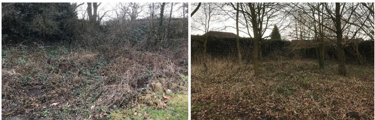
Figure Five: Two deep border areas which stand to be improved

The bins provided in the park only allow for the disposal of mixed waste. The council will consider if it is feasible to implement separate recycling facilities, but this will depend on ease of its disposal and the likely volume of such waste.