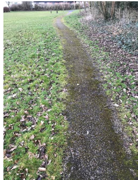
Figure Four: Narrow paths need widening and resurfacing

The paths around the park are generally in a good condition, but the south and eastern paths were gravel-surfaced rather than tarmac. They have narrowed and deteriorated over the past few years and require upgrading.