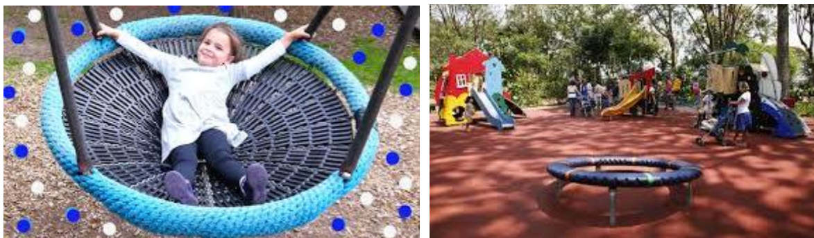
Figure Three: Spiders web swing and Supernova

Subject to a decision on the MUGA, the council will look to lower the basketball hoop and investigate resurfacing the court with a wet-pour in place of the harder asphalt, markings will be considered as appropriate.