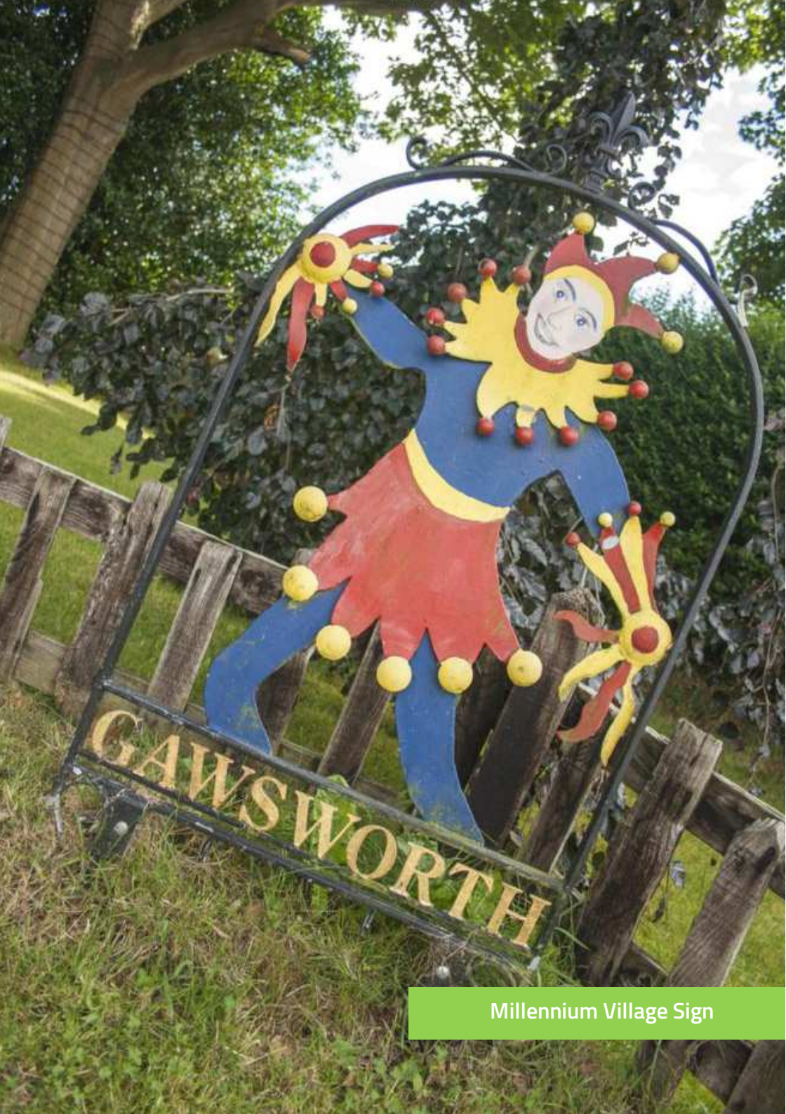
Millennium Village Sign